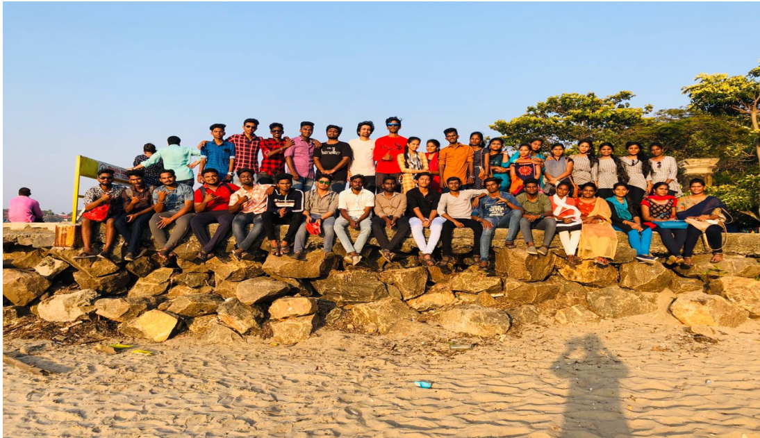
Group Photo of students at COCHIN FORT

As part of hands-on training and as a welcome relief from strenuous academic work, the final year students went on a study tour to COCHIN, MUNNAR, WONDERLA between 17-02-2020 to 21-02-2020