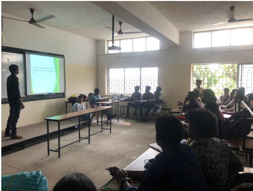
Students participating in the inter departmental Connections