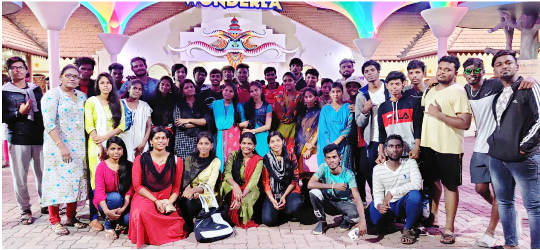
Group Photo of students at WONDERLA (COCHIN)