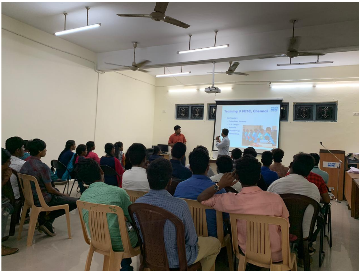
Student participants from the Department of Mathematics attending a lecture at NSIC Regional office at Ekkaduthangal, Chennai