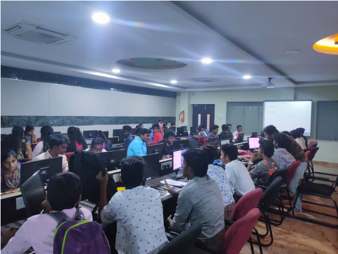
Students during a Hands-on training session of the course on Introduction to LaTeX

A certificate course on Introduction to LaTeX was conducted by the Department of Mathematics from 05/Dec/2019 to 01/Feb/2020 for 30 hours. The course aimed to provide students with exposure to typesetting journal articles, technical reports, books, and slide presentations. A total of 56 students benefited from the course.