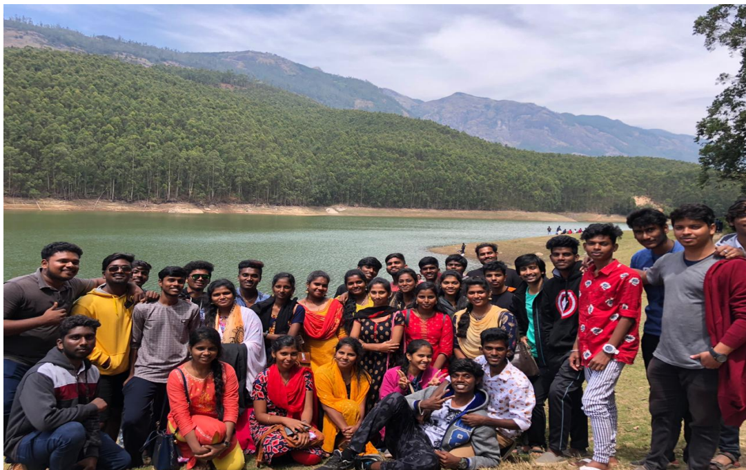
Group Photo of students at MUNNAR ECHO POINT