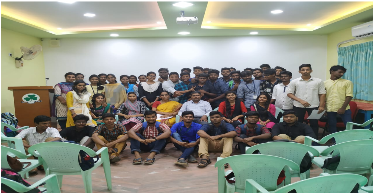
Student participants from the Department of Mathematics during training programme on Entrepreneurship