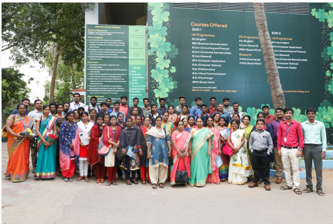
Participants from various Colleges for the National Workshop on R Programming