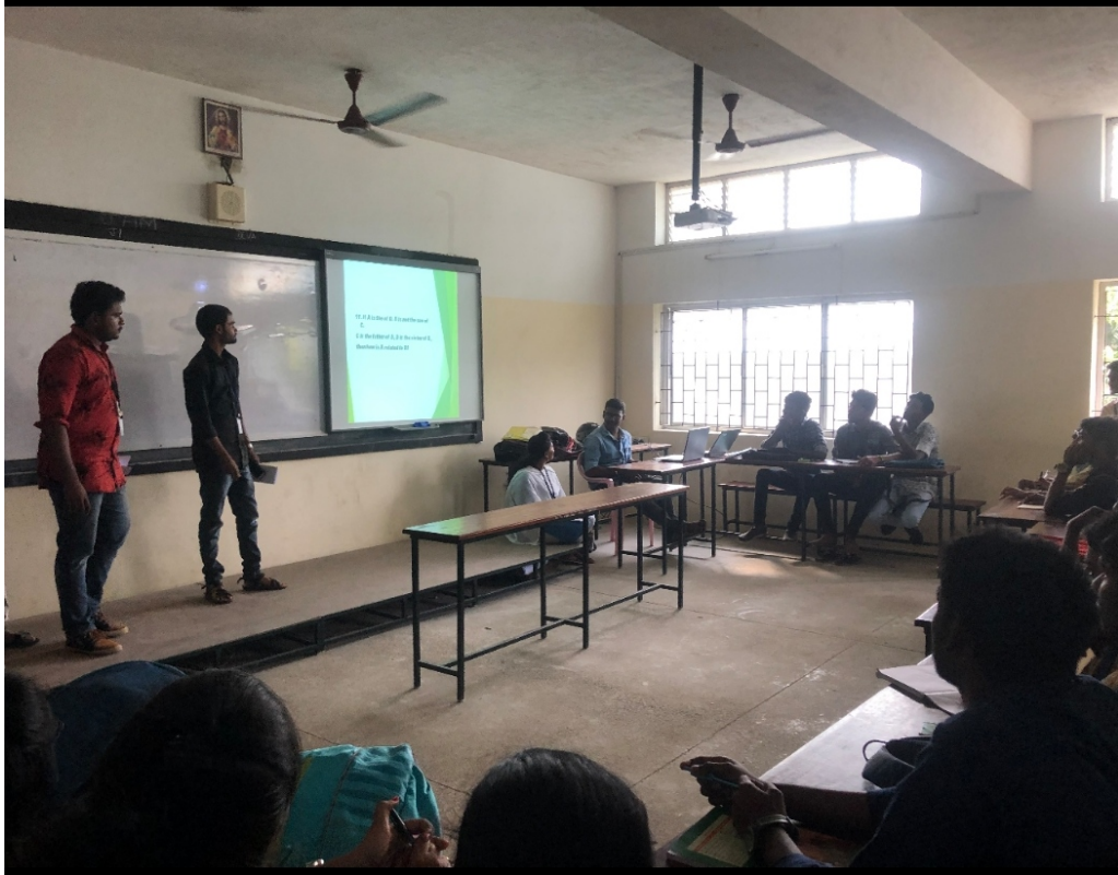
Students participating in the inter departmental Quiz